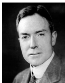
John D. Rockefeller, Jr.

Several locations for the UN were considered, but the decision was made when John Davison Rockefeller, Jr. (1874-1960), son of Standard Oil industrialist John D. Rockefeller, donated $8.5 million to purchase land in New York City for the organization. He was the father of the five famous Rockefeller brothers, including former New York Governor, Nelson Rockefeller (1908-1979).