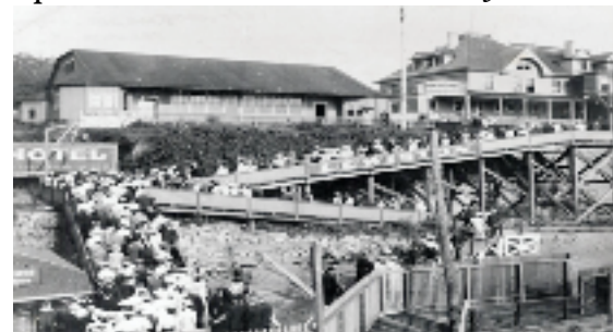
(Above) Throngs of passengers entering Lewiston at the steamship docks which processed thousands of people a day. At the upper right you can see the Cornell House.