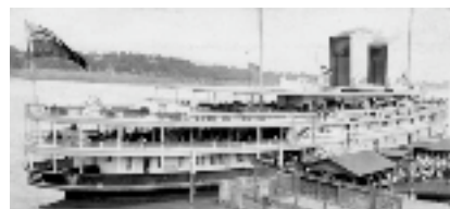
(Left) Here is the steamship The Cayuga at the Lewiston dock.