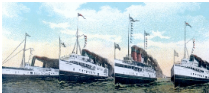
The Chicora The Chippewa The Cayuga The Corona (Above) This is the fleet of steamships that serviced Lewiston, owned by the Niagara Navigation Company, later to become the Canada Steamship Lines.

the Pan-Am Exposition in Buffalo when an estimated 25,000 passengers a day came through Lewiston to take a train to Niagara Falls and Buffalo and then on to destinations throughout the U.S.