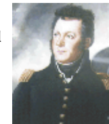
Major George Armistead

On June 27, 1813, Major Armistead was happily reassigned to command Ft. McHenry in Baltimore, Maryland, where he ordered "a flag so large that the British would have no difficulty in seeing it from a distance." It was this 42' x 30' 15-star, 15-stripe flag, that gave inspiration to the defenders of Baltimore and inspired a new national song. Ever since, the former Ft. Niagara officer has been known as the "Guardian of the Star-Spangled Banner" which is now on display at the Smithsonian Institution.