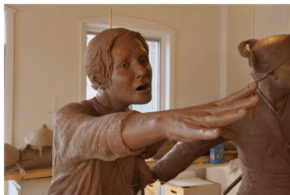
This is one of three large scale clay models depicting a Lewiston woman reaching out and being saved by a Tuscarora native. The bronze sculptures will be larger than life-size.

Despite being outnumbered 30-to-1, the Tuscaroras were able to buy the fleeing residents enough time to get out of harm’s way, saving dozens of American lives.