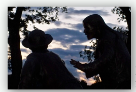
Home of Freedom Crossing

Welcome to Lewiston, NY HistoricLewiston.org 716-754-4214