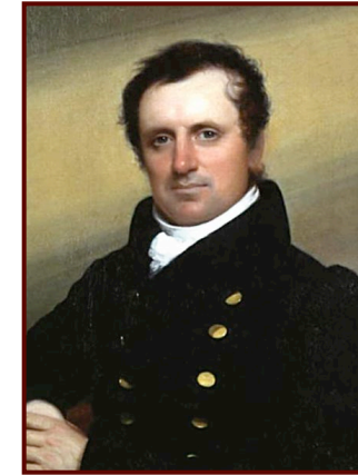
James Fenimore Cooper

The Spy became the first American novel to achieve a wide circulation. He