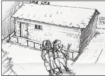
As Hustler's Tavern may have looked 200 years ago.