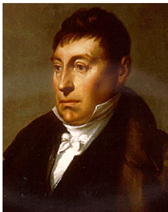
Marquis de Lafayette