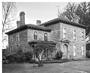
An early photograph of Kelsey's Tavern at 625 Center St. where Lafayette stayed.

8pm: Lafayette arrives in Lewiston and goes directly to a reception at Kelsey's Tavern.