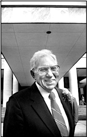
Armand Castellani Castellani Museum

The Museum, which opened in 1990, is located in the center of the Niagara University campus and is open to the public with free admission.